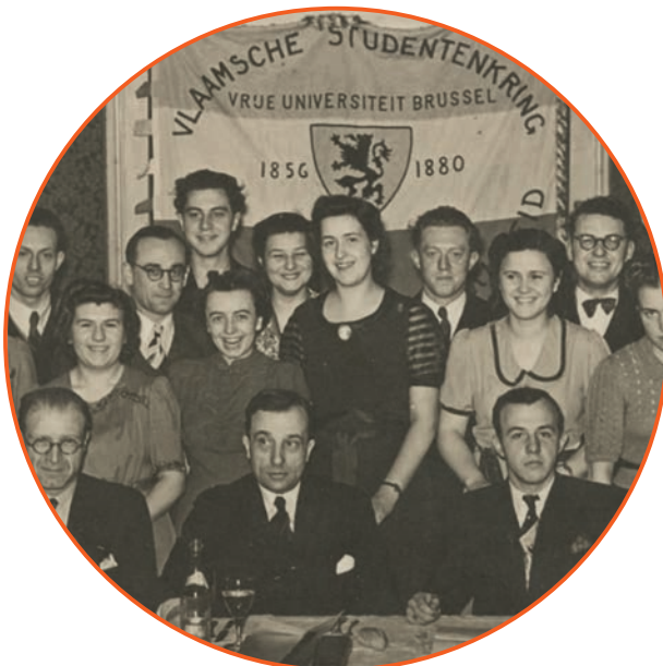
Student associations were a driving force in the establishment of a fully-fledged Dutch-speaking university in Brussels.

In the aftermath of the May 1968 left wing protests in Paris, students across Europe took to the streets, calling for educational reform and public participation. Soon after, on 13 June 1969, the Coordinating Committee of the Dutch-speaking University Community was founded,