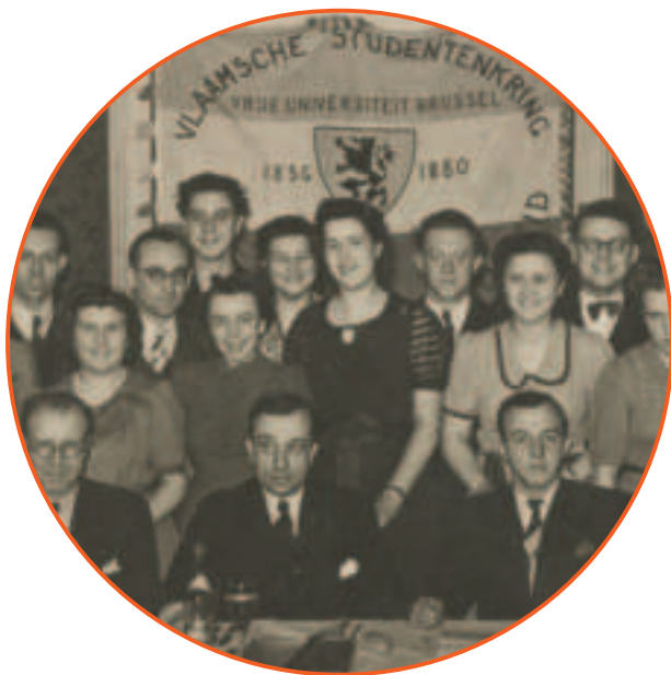
Student associations were a driving force in the establishment of a fully-fledged Dutch-speaking university in Brussels.

In the aftermath of the May 1968 left wing protests in Paris, students across Europe took to the streets, calling for educational reform and public participation. Soon after, on 13 June 1969, the Coordinating Committee of the Dutch-speaking University Community was founded,