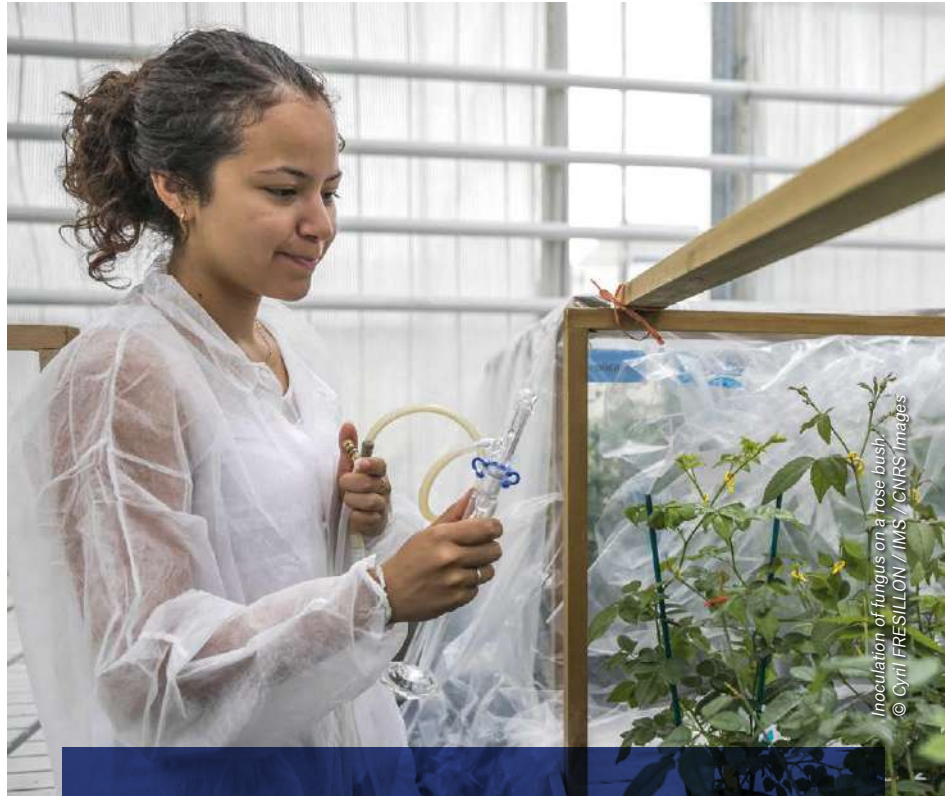
Inoculation of fungus on a rose bush.

In disciplines such as political science, economics, management, law, business, communication and marketing , the level of French required varies.