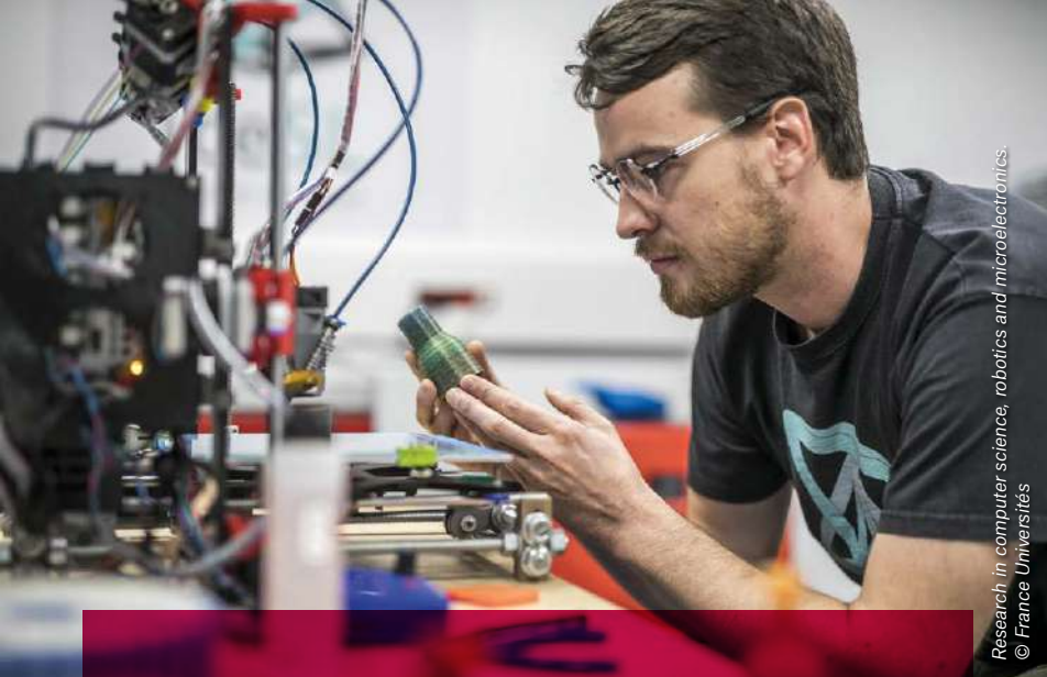
Research in computer science, robotics and microelectronics.