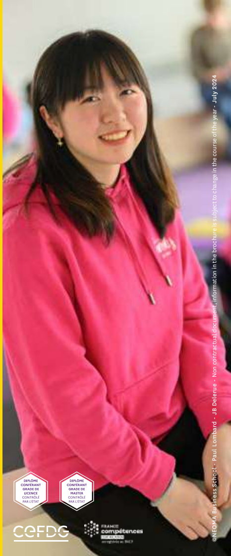
Non contractual document, information in the brochure is subject to change in the course of the year - July 2024